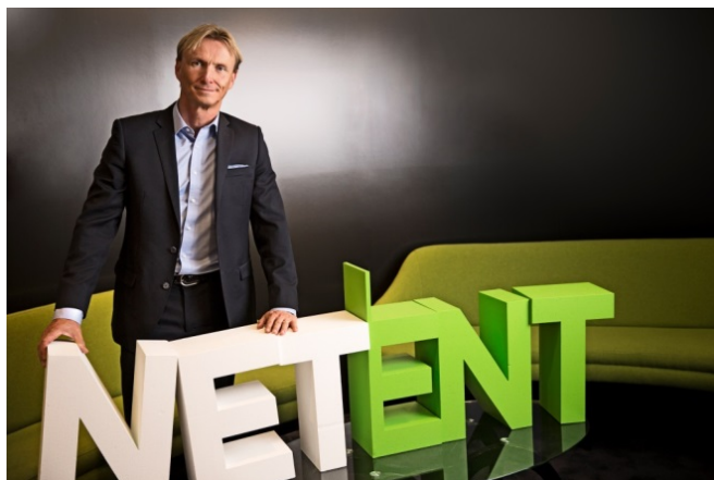
Per Eriksson, President and CEO, NetEnt AB (publ)

There is a clear trend – people spend more and more time and money online, consuming digital entertainment including online casino games. The global online gaming market is supported by ongoing migration from land-based gaming. We will continue to focus on premium digital casino solutions, solutions that enable success for our customers. We see good conditions for continued strong growth in 2016 supported by growing market shares in the UK, a large pipeline of signed customers yet to be launched, mobile growth and the expansion in North America.